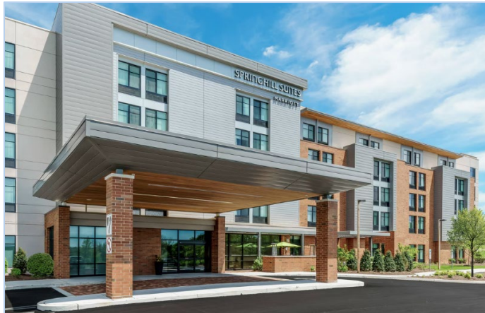
SpringHill Suites by Marriott Philadelphia